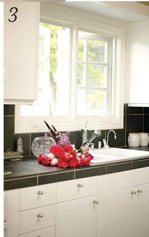
1. These exquisite pillows were made from old Victorian quilts, which Doreen purchased in her native Australia. 2. The loft guest bedroom is simply decorated yet focuses on the fine quality of heirloom linens, fresh flowers and such visceral elements as flowers, candles and Doreen’s own painting. 3. Brian often brings flowers home for Doreen from the farmer’s market.